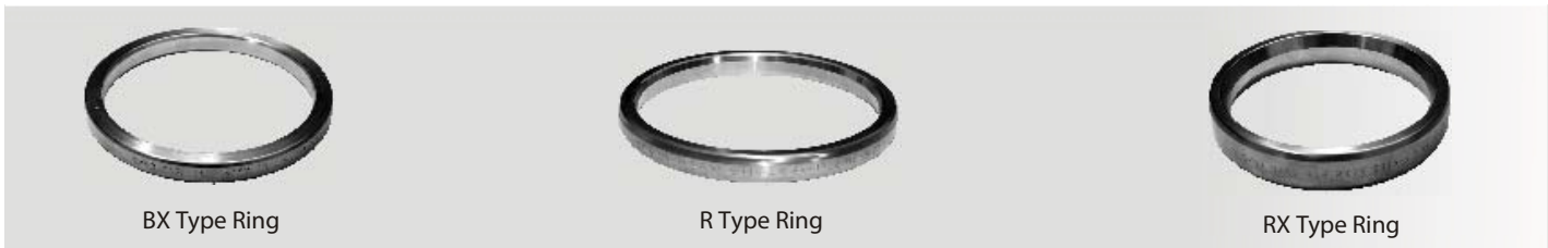
BX Type Ring